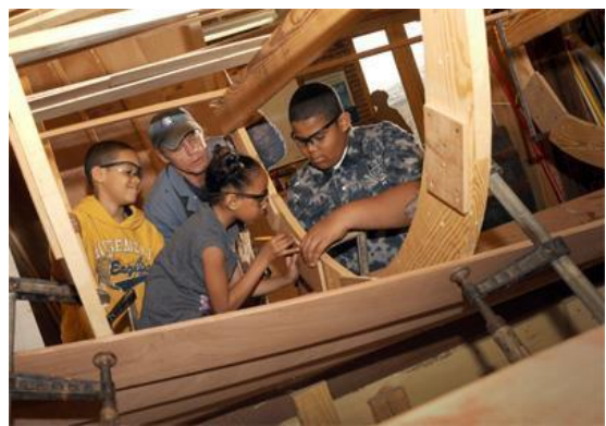
Frederick Douglass Isaac Myers Maritime Park

From South Dallas Street head west onto Eastern Avenue to President Street and turn right. President Street Station , a former train station, is one block away. It now houses the Baltimore Civil War Museum. Here is where Douglass escaped slavery in 1838 at age twenty by disguising himself and boarding a train heading to Philadelphia on the Baltimore, Wilmington and Philadelphia Railroad . The museum's exhibits interpret his escape.