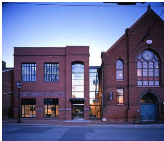
Banneker-Douglass Museum

From this farm, Douglass saw sailing ships pass by the farm on the Chesapeake Bay, giving him the inspiration to escape via water, although without a clear notion of which way to go. In April of 1836, he and several others were prepared to escape, but his plan was discovered, and the group was arrested and forced to walk 20 miles to the jail in Easton.