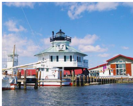
Chesapeake Bay Maritime Museum