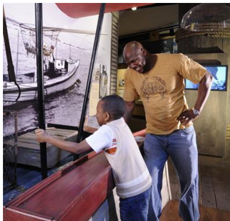
Reginald F. Lewis Museum of African American History and Culture.

Head north on President Street to the intersection with Pratt Street. The Reginald F. Lewis Museum of African American History and Culture is on the corner. This museum celebrates more than 350 years of Maryland African-American history and culture and includes the story of Frederick Douglass and the challenges and consequences faced by freedom seekers.