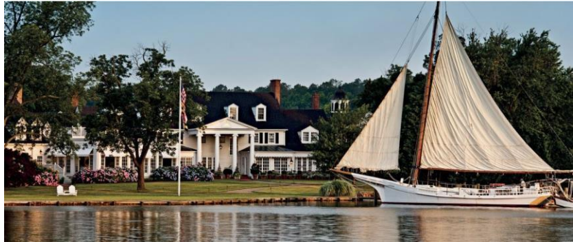
Inn at Perry Cabin