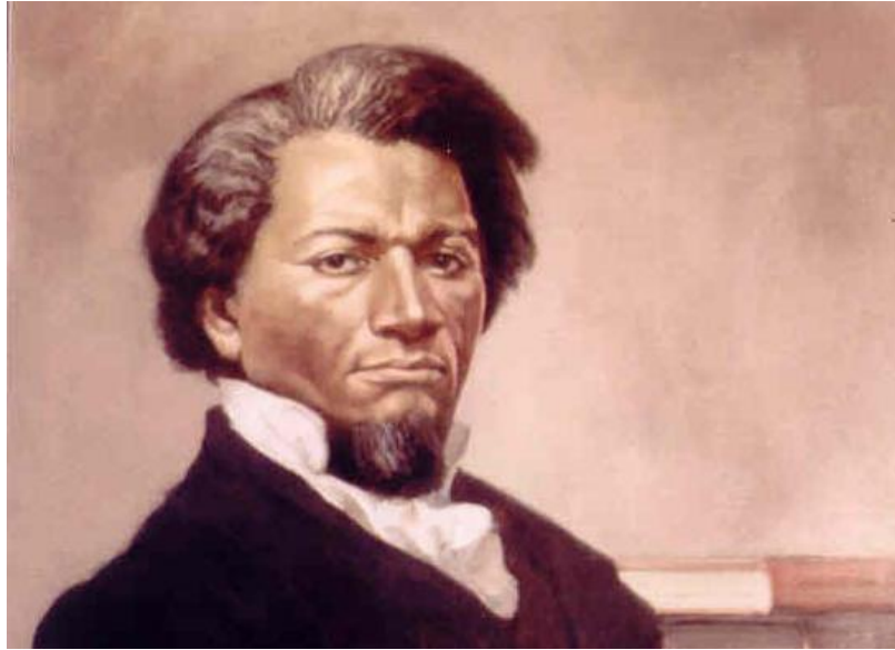
Photo: Frederick Douglass painting by Hughie Lee-Smith, courtesy of Banneker Douglass Museum's Fine Art Collection.