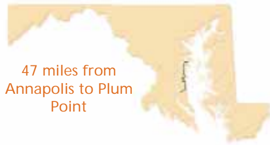
47 miles from Annapolis to Plum Point

During his explorations of the bay region four centuries ago, Capt. John Smith noted, "Heaven and earth never agreed better to frame a place for man's habitation." These words have taken on added significance with the designation of the all-water Captain John Smith Chesapeake National Historic Trail, which commemorates the voyages of Captain John Smith and his crew on the Chesapeake Bay and its tributaries during 1607-1609. Many bayside attractions, including several from Annapolis to Southern Maryland provide additional information about Smith.