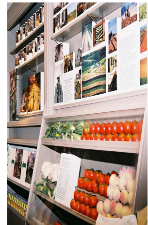
"Our Chesapeake Legacy Exhibit"

Discover the history and ecology of the Chesapeake Bay region and explore Queen Anne's County's, "The Gateway to the Eastern Shore."